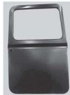
Right Door Shown

MD0160L DOOR LEFT Door shell only • Will fit later years with small lock modification MD0160R DOOR RIGHT Door shell only • Will fit later years with small lock modification